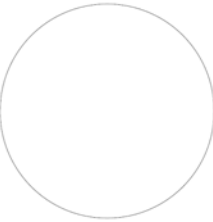
EXHIBIT C XX-VM-XX