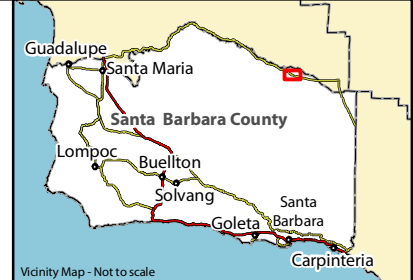
Vicinity Map - Not to scale