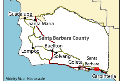
Vicinity Map - Not to scale